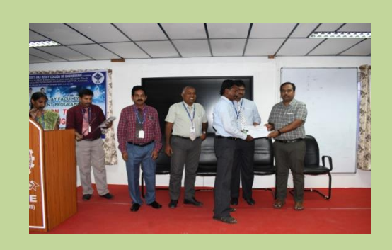
certificate distribution to the participants