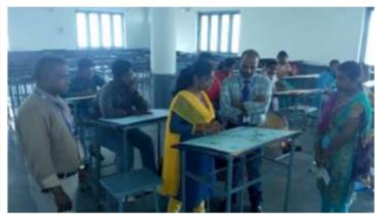
Student Explaining her poster