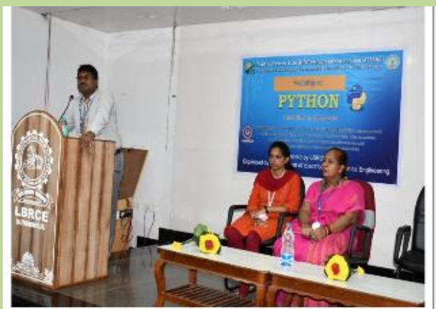
Addressing by Principal