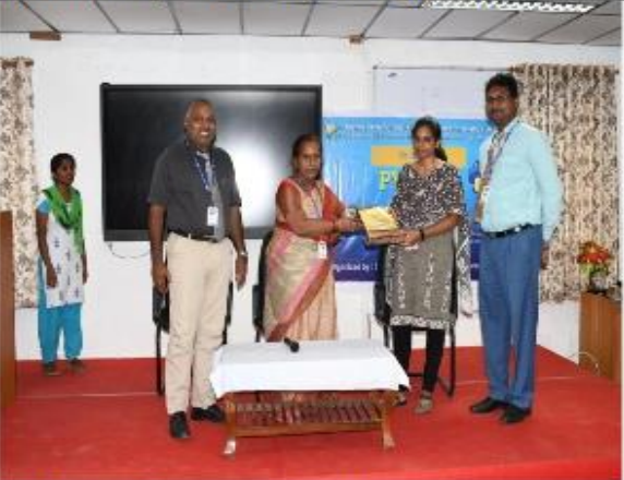
Felicitation of the Resource Person by HOD & Co-Ordinator-EEE